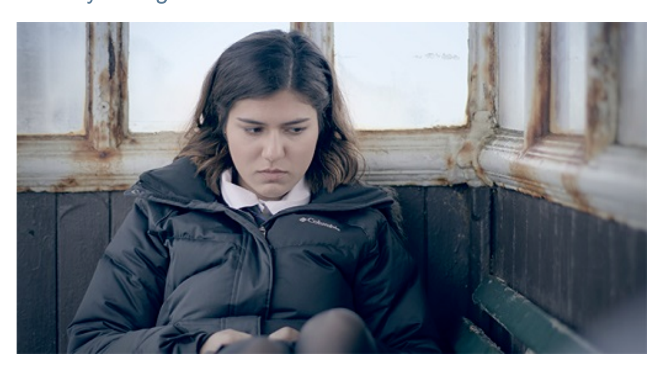
Figure 5 Lilly from the interactive 'A Support Net' which is associated with this OpenLearn course

Although practitioners such as clinical psychologists, psychotherapists and counsellors may use terms such as 'anxious', 'depressed' or 'psychotic' to describe the experiences of their clients or service users, they tend not to use the formal diagnostic categories developed within psychiatry (or from the medical perspective).