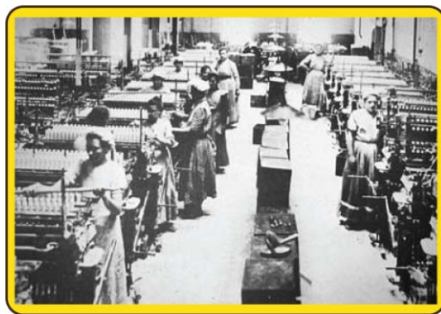
Figure 1.1: Industrial revolution

Before the 1900s, most counselling was in the form of advice or information. In the United States, counselling developed out of a humanitarian concern to improve the lives of those affected by the Industrial Revolution in the 1850s to around the early 1900 (Figure 1.1). The social welfare reform movement, women's right to vote, the spread of public education, and various changes in the population makeup (such as the large entrance of immigrants) also influenced the growth of counselling as a profession.