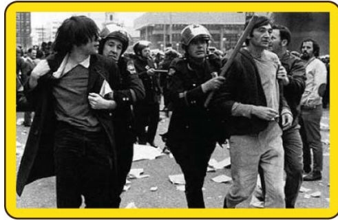
Figure 1.2: Protest during the 1960s